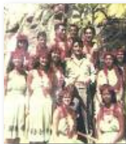
Elvis visits PCC in the late 60's.

What we now know as Polynesian Cultural Center found its first inspiration in the late 1940s when church members started a hukilau (a fishing festival complete with luau feast and live entertainment) as a fund-raising event. Thus began the busloads of tourists thronging to Laie to experience the cuisine and culture of Polynesia. A decade later, students began production of Polynesian Panorama featuring traditional song and dance, which sold out venues in Waikiki. This inspired the construction of PCC's original thirty-nine structures around a twelve-acre taro patch with the help of large groups of missionary volunteers. By importing materials and artisans from the South Pacific, village houses were crafted in authentic style and the Polynesian Cultural Center opened to the public on October 12, 1963.