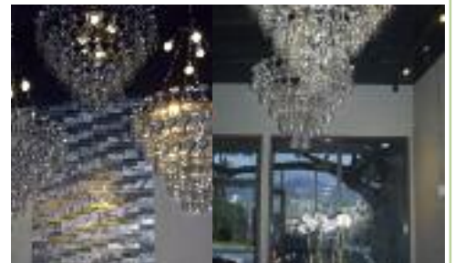
Loved the wine glass chandeliers!