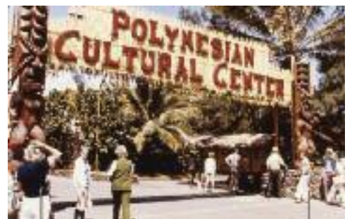
The original entrance into the Center

When the Center celebrated four decades of entertaining and educating in 2003, it was time for a facelift with enhancements taking place around the property starting at the grand front entrance. Hand-carved replicas of voyaging canoes and mini-museum artifact displays now give visitors a glimpse of what's to come before they even pass through the front doors. Rapa Nui (Easter Island) was added to complete the Polynesian Triangle, featuring moai statues created onsite by native artisans. Hale Aloha focuses on our own Hawaiian Islands, housing the Ali'i Luau, along with the new Hale Kuai and Hale 'Ohana complete with songs and dances from around the Islands. Over the years, PCC's commitment to traditional culture has won many awards including the 'Oihana Maika'i Award by the State of Hawai'i for excellence in service and productivity, and the Ali'i Luau won the "Keep It Hawai'i" Award for most authentic luau from the Hawai'i Visitors & Convention Bureau. In 2013, Ha: Breath of Life, was selected as Hawai'i's