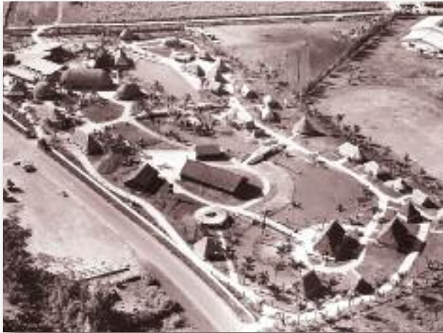
An aerial view of the village back in 1963.

When Mormon missionary Matthew Cowley visited New Zealand in the early 1920s, his love of the Maori people and concern for the erosion of their traditional customs inspired the idea for cultural renewal through “a little village with a beautiful carved house.” If Cowley could