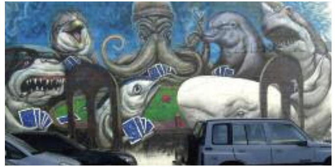
Another one of the cool murals you can see as you drive along the streets of Kaka'ako

In addition to arts and food, more entertainment options are being developed as well. It's not just a night at the movies anymore. The Groove Hawaii, a new three-acre site for family entertainment, just opened between Auahi and Koula streets, facing Ala Moana Blvd. Kids and adults can now race real gas-powered go-Karts here in town rather than driving over to Kapolei. Fans are already praising the place because other tracks offer the quiet,