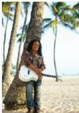
Henry Kapono head up a list of stellar performers to take the stage that also includes Jake Shimabukuro

The fun begins at 9 a.m. with a very traditional double-hulled canoe procession into the lagoon while a traditional Hawaiian chant is being called and a kahiko is performed that is guaranteed to wow all the visitors. At 10 a.m. the games get going. On the water, teams will compete in a quarter-mile canoe races and stand up paddle board races the length of the lagoon. On land, teams will be able to compete in a series of ancient Hawaiian makahiki games such as the 'ulu maika (sand bowling), moa pahe'e (sliding), konane (Hawaiian checkers), haka moa (fighting chicken) and Huki Kaula (tug of war). There will also be plenty of handmade Hawaiian arts and crafts to look at and perhaps buy. The public invited to participate in the competition if they so desire for a small donation to WCC. Otherwise spectators will have plenty to watch, keep them occupied and entertain them on the beach in Waikiki.