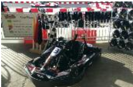
Gas-powered go-karts at The Groove Hawaii