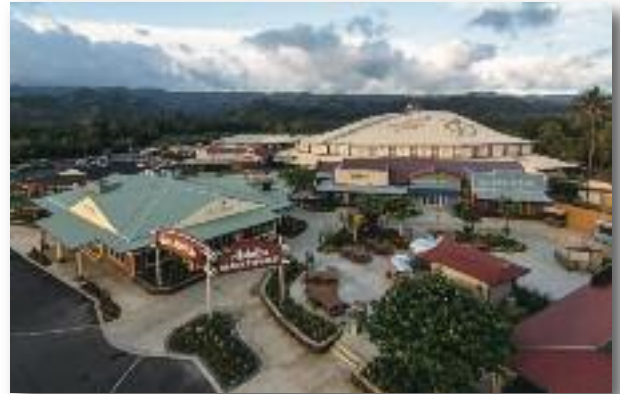
An aerial view of the new Marketplace as provided by PCC.

Retail stores run the gamut from Island home furnishings to fashions to Hello Kitty to Polynesian