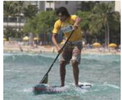
One of the competitors in last year's SUP race.

Duke Paoa Kahinu Mokoe Hukikohola Kahanamoku, known as "Paoa" by his closest acquaintances and "Duke" by the rest of the world, was born on O'ahu in 1890. He would learn to swim in the clear waters of Kalia at the far end of Waikiki where the Hilton Hawaiian Village now stands, and he would grow to become an Olympic competitor and gold-medal winner as a swimmer and the world's greatest waterman. In these roles, Duke travelled the globe, bringing with him extraordinary athletic skills and an overall presence that inspired and amazed while inviting others to experience the aloha of Hawaii.