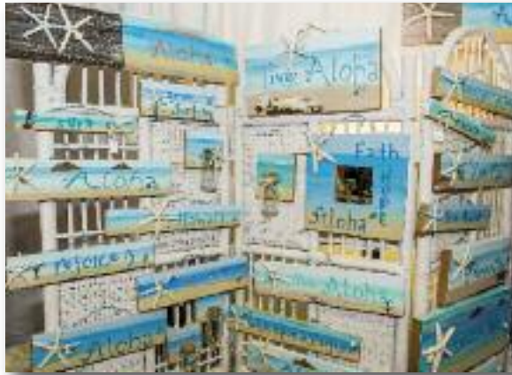
Over 475 vendors will be at the Made in Hawaii Festival August 19 th - 21 st .

Visitors who happen to be on Oahu the weekend of August 19-21 will discover they hit the mother load when it comes to grabbing some keepsakes to take home with them as the Made in Hawaii Festival returns to the Blaisdell Exhibition Hall and Arena for the 22nd time. While the festival originated as an exhibition and networking opportunity for local products and businesses with a mere 61 booths, it has grown exponentially and has exploded into the event we all know and love today.