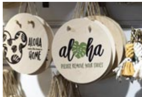
There will booth after booth of locally-made items to choose from.