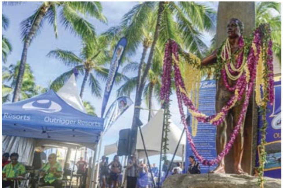
Visitors won't want to miss the photo op with Duke's statue adorned with lei. The festival runs from August 19 - 27.

The Duke Kahanamoku Ocean Festival Board of Directors said the following about the name change: "Recognizing the evolution and expansion of the watersports and lifestyle disciplines that continue to blossom locally and throughout the world as a result of Duke Kahanamoku's influence and Hawaii's powerful messaging to the mainland and internationally, the Board of Directors, a division of the Outrigger Duke Kahanamoku Foundation, recognized the opportunity to expand the reach of the Waikiki based event and explore collaborations that go beyond sport and into the "Festival" genre ranging from