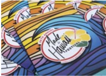
The 29th Annual Made in Hawaii Festival moves to the Hawaii Convention Center August 18 th - 20 th

It's the ultimate shopping experience to find locally-made items. The Made in Hawaii Festival has always been a sure-fire hit, but it's been looking to find its feet location-wise ever since it left the Blaisdell. Well, it's official, the 29th Made in Hawaii