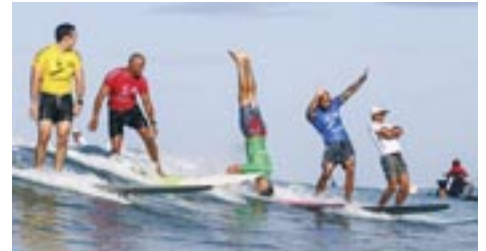
Get ready for some wild & wacky action on the waves as Duke's Oceanfest hits Waikiki August 17-25

Waikiki's premier ocean sports festival, Duke's Oceanfest, is a unique summer event that pays tribute to Hawaii's legendary waterman, Duke Kahanamoku. As one of the greatest watermen in history and a renowned figure in Hawaii, Duke's Oceanfest celebrates his life, athletic prowess, and enduring spirit that lives on through the water and beach sports he loved.