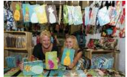
Some of the many items at the Made in Hawaii Festival August 17 - 19.

From coffee to cookies, clothing, cosmetics and more, Hawaii produces some of the most unique products in the world due to geography and agricultural resources ranging from noni that goes into health tonics, to rare lehua honey harvested from bees who gather the nectar of ohia lehua trees that grow only on Hawaii island.