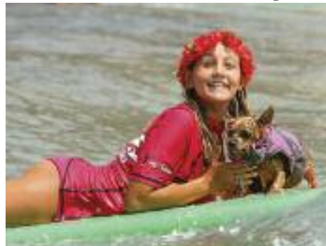
Dogs like to surf too!

Duke's OceanFest first began as a one-day celebration that coincided with Duke's birthday (August 24, 1890) to celebrate the issuance of Duke's commemorative stamp back in 2002. Since then, the festival has grown, in large part thanks to all the support it has received over the years, and is now a nine-day event, filled with just about every type of sport close to Duke Kahanamoku's heart, including Surfing, Longboards, Paddleboard Racing, Swimming, Tandem Surfing, Surf Polo, Beach Volleyball, and Stand-Up Paddling. This fun fest, which celebrates Duke Kahanamoku's life, his athletic contributions, and his spirit that continues to live on, returns to Waikiki this month from August 18th - 26th.