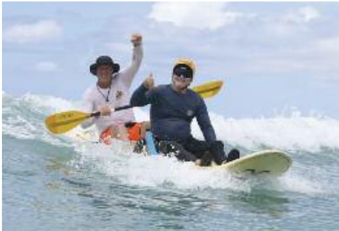
Surfers give a big thumbs up in last years AccesSurf Hawaii Adaptive Surf Championship

Duke's GM before he retired) says one of the things that make this annual festival so special is that through it, "we are paying tribute to one of the world's most renowned watermen, (Duke) and how he continues to inspire watermen and women around the world. Duke's OceanFest is committed to passing on Duke's love for the ocean and the aloha he shared with all people who came to Hawaii."