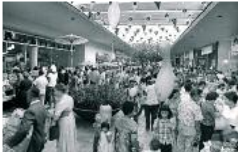
Early 60s sidewalk sale

Hard to believe, but on August 13th, it will have been 60 years since Ala Moana Center first opened to the public. The first phase of the center opened with 87 stores on two levels, including 680,000 square feet of leasable area and 4,000 parking spaces. Sears, Shirokiya and The Slipper House were a few of the original stores. Seven years later, in 1966, the second phase opened, doubling the size of the center to 1,351,000 square feet, with a total of 155 stores and