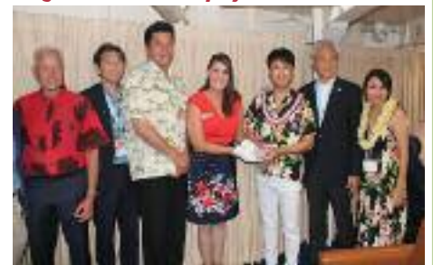
The Sadako Legacy Foundation presented the USS Missouri Memorial Association with one of Sadako Sasaki's paper cranes for display as part of the Associations yearlong commemoration of the 75th anniversary of the end of WWII.