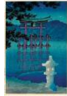
Starlit Night, Miyajima by Kawase Hasui 1828

After I get my Phantom fix, I'm heading over to the HONOLULU MUSEUM OF ART to check out this new exhibit called Something Borrowed, Something Blue: Monochromatic Prints in 20th-Century Japan . I know the title