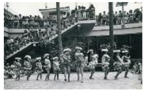
Keiki Hula back in 1972

Hartfield's as a prank, and leaving it at her door pretending it was from some guy she had just started dating at the time. I have no idea why, I was 15 at the time. It sounded like a good idea. I even worked at Woolworth's one summer selling fake perfume as part of their 'blue light special'. I think if most of that grew up here think back, you'll find you have just as many memories of Ala Moana as I do.