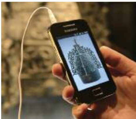
Bishop Museum just got a bit easier for foreigners that don't speak English with their Mobile Audio Tours.

The big news this summer is BISHOP MUSEUM'S new audio tours in multiple languages that are accessible through smart-phones, tablets and other mobile devices. The tours were recorded in Chinese, Korean and Japanese as well as Hawaiian by native speakers. The audio tour includes a series of information short clips describing forty treasured objects throughout the Hawaiian Hall complex. Children's voices were used to create kid-friends versions of the audio tours targeted at children ages 5 to 12. Special audio resources like mele (song) and oli (chant), and recordings of Museum contributors such as Mary Kawena Pukui, are woven into a number of the audio tour stops, giving visitors a deeper understanding of the importance of the object they are looking at. To avoid the costs associated with using a third party company to provide the audio tour hardware, the Museum utilized the popularity of smart-phone devices, Wi-Fi hot spots, QR codes, and simple audio editing software like Garageband to build the audio tour system in-house. Later phases of the audio tour will include objects in all of the Museum's major exhibit halls.