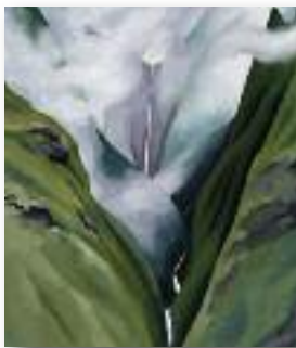
One of the Georgia O'Keeffe paintings on display during the exhibit.

Georgia O'Keeffe and Ansel Adams. Paintings and photos at the Honolulu Museum of Art. If you are fans of their work you'll have the show on your radar. What you may not know is that