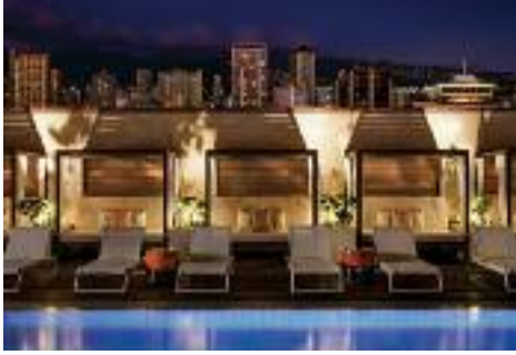
Private cabanas on the infinity pool deck

Just over a year after the Waikiki Parc closed its doors, and several million dollars later, a new luxury boutique hotel emerged, and the Halepuna Waikiki by Halekulani welcomed its first guests a few weeks ago on October 25th.