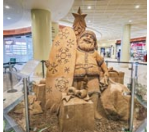
One of two sand sculptures in the Sheraton lobby

The holiday spirit bursts to life in the islands during December. There are plenty of events, decorations, and celebrations all month long to delight kids of all ages. Here are just a few ways to get into the Christmas spirit this season, island style.