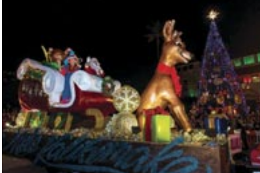
One of the amazing floats in the Electric Light Parade taken a few years ago. The parade will take place on December 2.

Honolulu City Lights is a beloved tradition for residents and visitors alike, offering a unique blend of Christmas spirit with the beautiful Hawaiian setting. It's a time when the community comes together to celebrate the