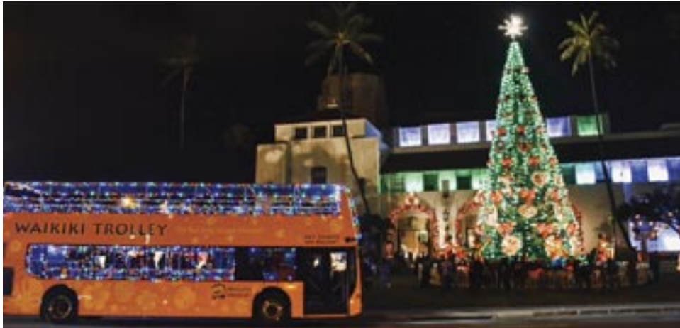
Honolulu City Lights is a highlight of the holidays in Honolulu. Head down to walk around throughout the month of December of take a trolley to make a night of it.

So, your guest is spending Christmas in Hawaii. How can you help make it memorable? Well, let's be honest, the location does a lot of the work for you. Mother Nature usually graces us with beautiful Hawaiian weather for all those people escaping the snow to enjoy. But the weather is only part of what makes a Hawaiian Christmas special. Here's a list of a few other activities they can take advantage of during their holiday, starting with the Christmas Lights.