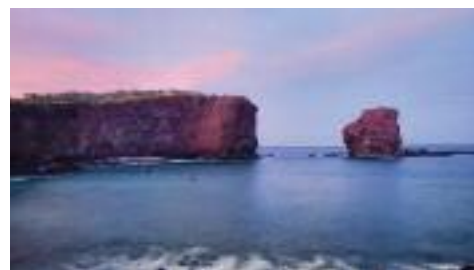
What better way to spend a romantic weekend than hiking to Sweetheart Rock on Lanai?  which reopens on February 1st.

Then there are the restaurants of course. As