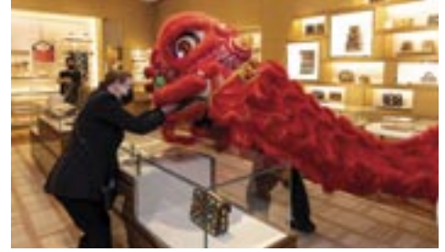
The lions will spread good luck through all of the mall tenants.

these days, and there will be hundreds and hundreds of folks on site that day.