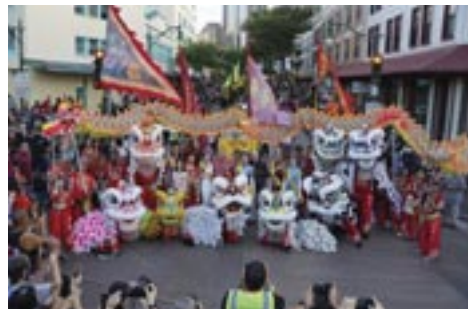
The parade marches down Hotel Street to the Festival.

6 p.m. - 10 p.m. - All activities except for bouncy houses continue.