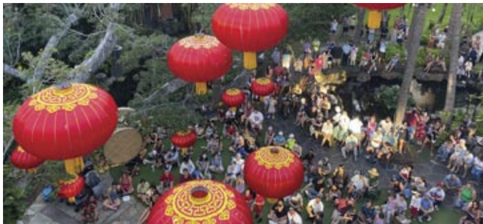
Look for festive decorations throughout the month.

Enjoy the festivities throughout the month, and to be safe, always bring lai see with you when you go out. The term "lai see" translates to "lucky money" in Cantonese, and the color red is considered auspicious in Chinese culture and symbolizes good luck and prosperity. Lai see is a cherished tradition that adds joy and positive energy to special occasions such as the Lunar New Year, fostering a sense of generosity and goodwill within the community – and keeps those hardworking lions happy, so be prepared! If you don't have any lucky red envelopes handy, remember that it is customary to use crisp, new bills inside the red envelope, so have a few ready to go in your bag. And, although crisp new bills are best, those lions are hungry and will 'eat' whatever bills you have handy. Whatever you do to celebrate the occasion, enjoy. Kung Hee Fat Choy!