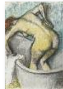
The Bath: Woman Sponging Her Back, Pastel on paper. c. 1887 Edgar-Hilaire Germain Degas (French, 1834-1917)