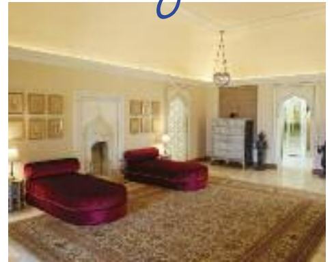
The bedroom of the Mughal Suite at Shangri La after preservation work.

Hawaii Calls – especially to an heiress on her honeymoon. Actually, in 1935 Doris Duke was on her way back from a honeymoon trip through the Muslim world and had an extended stay in the islands. She found herself in love with the Mughal art and Hawaii.