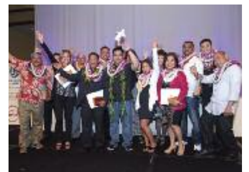
Finalists and winners from lodging properties statewide celebrate their wins.