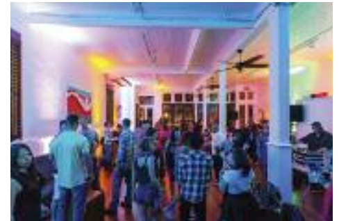
Don't miss the Pow! Wow! events. determined. Purchase tickets at Bamp Project.