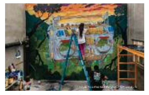
The "Wooden Wave" being painted at the 'Alohilani Resort last year.

Fr Pool Party and Brunch alongside POW! WOW! artists Alohilani Resort