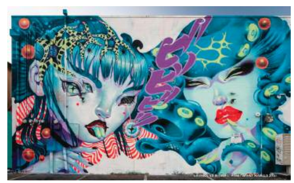
One of the many murals in Kaka'ako that was painted last year. This one was a compilation between Lauren YS and Onek from POW! WOW! HAWAII! 2019.