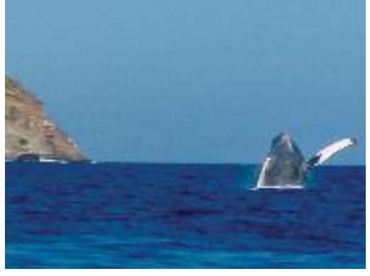
A whale breaches off of Koko Head

Our cetacean friends are already halfway through another wonderful season of tailslapping ocean antics here in the islands, and it's no surprise that their annual visit is one of the mostanticipated season in the islands.