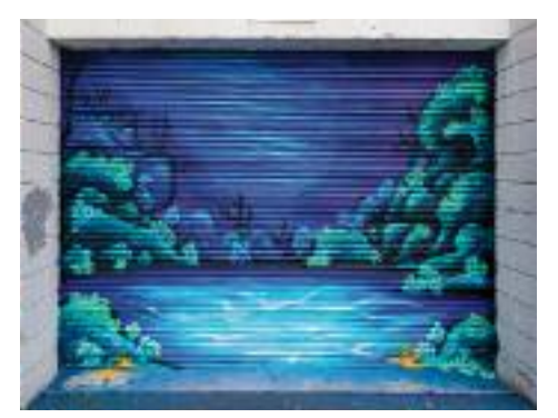
Marko Livingston jazzed up this drab garage door

The festival has turned into a mural fest. Not all murals are replaced every year. Still, pictures are highly encouraged. The really