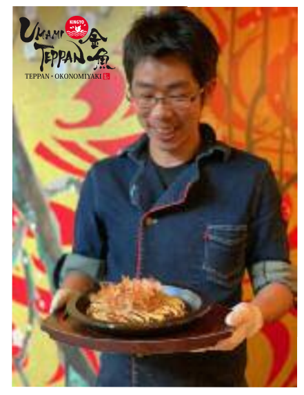
UMAMI TEPPAN KINGYO

Everyone has a favorite. What's yours? Thin Mints? Samoas? Tagalogs? Do-si-dos? You know what we're talking about. The Girl Scouts are back with those sinfully delicious cookies starting February 22 through March 31. Can't find any? This year you can download the newly enhanced official Girl Scout Cookie Finder app, free for your mobile device or tablet.