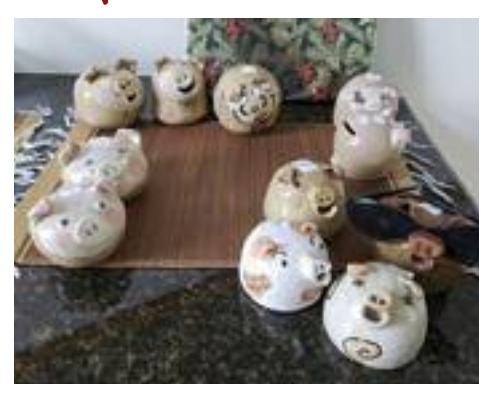
The Pigs are out and ready at Louis Pohl Gallery

The first Chinese arrived in Hawaii via fur trading ships returning from the West Coast of America. The year was 1788. Many were carpenters and smiths. They set up business and stayed. More craftsmen arrived in 1823, bringing the first sugar mill. Plantation owners recruited many more and Chinatown was born. Hawaii had celebrations and one more was welcomed – Chinese New Year. The lunar new year dates back to 2,600 B.C. when the Emperor Huang Ti introduced the first cycle of the Chinese Zodiac.