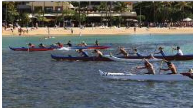
The Challenge is always exciting for visitors to watch. Please remember to tell your guests to head top the beach in front of the Hilton on February 24th.