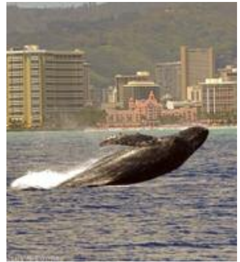
It's that time of the year again where those beautiful creatures can be seen playing off the shores of Waikiki.

Early morning, heading out from Honolulu harbor in search of 40 tons of fun. "Thar she blows," someone says as one of Hawaii's 5,000 warm-water loving winter visitors exhales. Humpback whale watching is a major winter activity in our waters. Even folks who aren't keen on the ocean love to get up close and personal to ooh and aaah at the great behemoths. When the guy standing a few feet away says, "that's a whale of a way to start the day," and everyone groans.