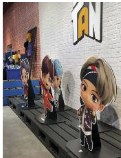
At the BTS: Map of the Soul pop-up shop, fans can shop for official BTS merchandise and apparel and pose for pics with Tiny Tan characters representing each group member, from left RM, Suga, J-Hope and V.

A sure sign that Korean culture has indeed won us over, is that it's taking over the Target wing at Ala Moana Center, which is now home to five boutiques catering to fans of Korean music, dramas, health and beauty products. Here's a look of what's available there now.