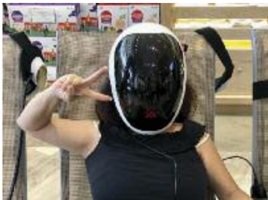
At Korean health product retailer Health Korea shoppers can try wellness appliances ranging from an LED mask to massage chairs.

Unless you've taken a pause from all media over the past three years, you couldn't have helped hearing about BTS. The Korean supergroup has made news continuously by winning several American music awards, breaking records for