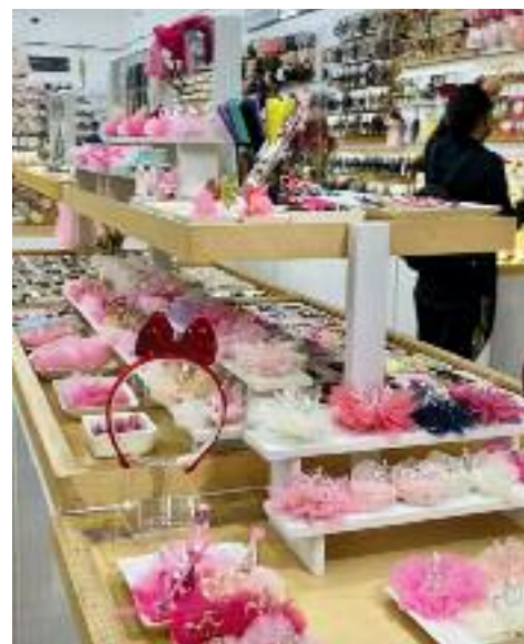
Pink Box also carries plenty of girly items, Korean-made jewelry and accessories.

Formerly known as N.Cat on Keeaumoku Street, its move to Ala Moana Center quadruples its original square footage, making room for more K-pop music and merchandise, and more