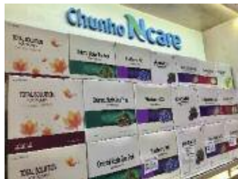
Health Korea carries a vast range of Chunho N'Care food supplement juice packs to boost vitamin and mineral intake.

South Korea has emerged as a leader in the health and beauty fields, and