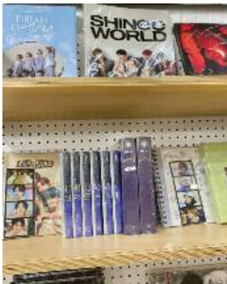
K-pop merchandise on the shelves at Pink Box.

Formerly known as N.Cat on Keeaumoku Street, its move to Ala Moana Center quadruples its original square footage, making room for more K-pop music and merchandise, and more