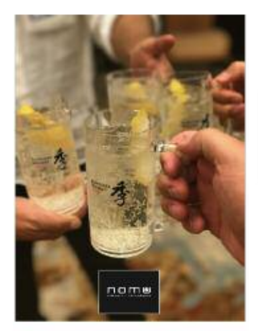
The only place in Hawaii to enjoy Whisky Highballs on tap!