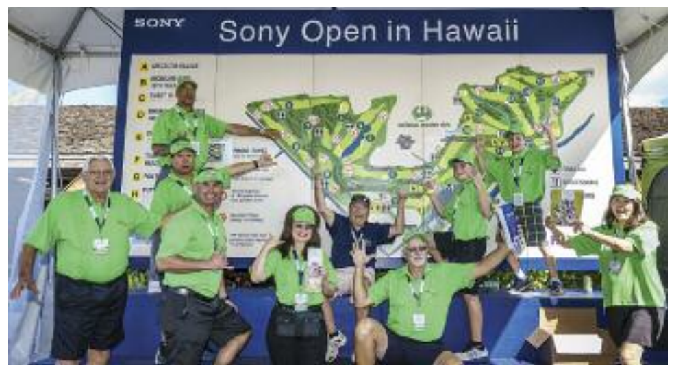
It takes an army of volunteers to put on the Sony Open, but they sure have fun!

It's swing-time again for the Sony Open in Hawaii. Think premier location, top golf stars, and great weather (even if it rains, it is warm rain). Golf stars, first-timers, fans and media are always thrilled to be in Hawaii. Even if you don't play golf, the excitement, the skill and the expertise of those who are in the Open is without equal. The anticipation is totally infectious, maybe even more so this year, the 20th anniversary of the tournament, with a stellar line-up of golfers and a $6.4 million purse with a champion's prize of $1,152.000.