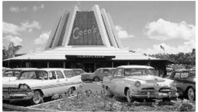
Who remembers this place? Coco's Coffee House at Kapi'olani Boulevard and Kalakaua Avenue, Honolulu, 1960