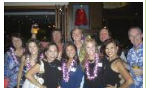
There's simply no room to list everyone's name here but let it suffice that the team from the Hilton Hawaiian Village was at the event in force! They are shown here with the guys from Forever Fab who graciously played a set for everyone.