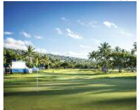
18th green, Sony Open in Hawaii at Waialae Country Club