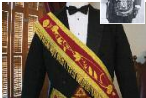
Then and Now: King Kālākaua's Masonic Apron