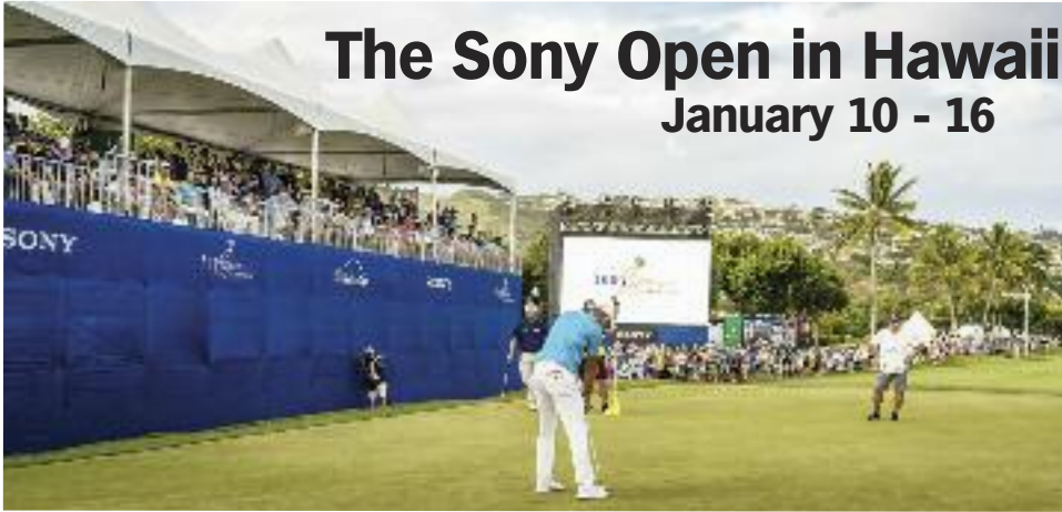
The Sony Open in Hawaii returns to the Waialae Country Club this month and will be welcoming spectators back to the green again!

Great news for golf fans – the Sony Group Corporation has renewed their sponsorship contract for the Sony Open in Hawaii with the PGA TOUR and Friends of Hawaii Charities, the tournament host, for another four years until 2026.