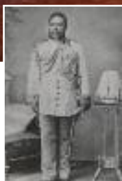
King Kālākaua in his Coronation Suit in 1883, and the reproduction that now joins Queen Kapiolani's coronation gown and robe in the Throne Room of the Palace.

November 16th, 2021 was not only King Kālākaua's 185th birthday, but it was also the day reproductions of the suit King Kālākaua wore at his coronation on February 12, 1883, and his masonic apron debuted at Iolani Palace as the latest additions to the Palace's Alii Gown Reproduction Project.