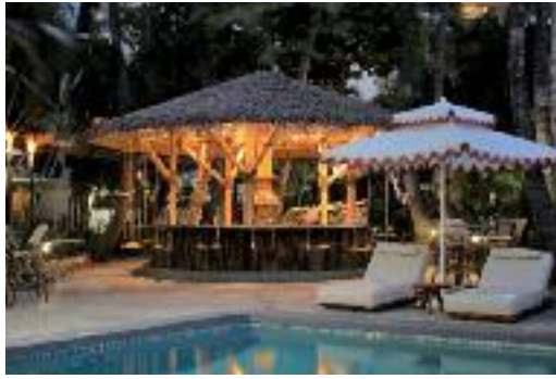
Swing away the day at the Hey Day Pool Bar from 12 p.m. to 8 p.m.

One of the more dramatic refreshes comes from the White Sands Hotel . Originally built in 1957, it's one of the last vintage walk-up