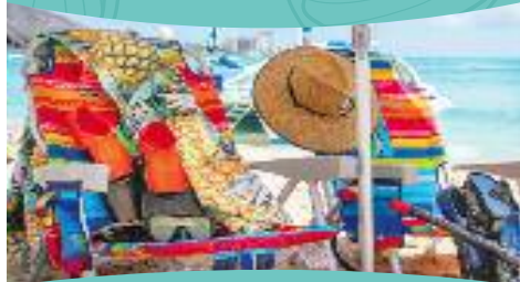
Big Wave Dave Surf & Coffee