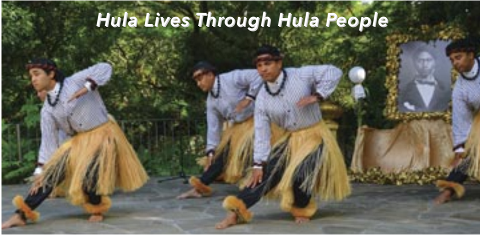
The 46th annual Prince Lot Hula Festival returns July 15th.

Founded in 1978 by the Moanalua Gardens Foundation (MGF) as a gift to the community, the festival honors Prince Lot Kapuāiwa, who helped reprise hula in Moanalua and reigned as Kamehameha V from 1863 to 1872. Held for years at the Gardens, the event was always free, helping to perpetuate Native Hawaiian culture and the art of hula. When the gardens' owner tried to implement a hefty fee, the event organizers decided to pick up and take the festival to 'Iolani Palace lawn - to the delight of hula fans and dancers. It was a hit and it looked as if the sky was the limit for this beloved festival – and then 2020 came. Like all other businesses, the festival pivoted and went virtual. Finally, after four long years, the festival is returning with a brand-new hybrid format, combining the best of both formats to reach the widest possible audience.