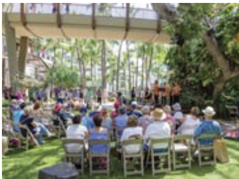
Visitors gather in the Royal Grove during last year's Waikiki Steel Guitar Week at Royal Hawaiian Center

Celebrate the soft, sultry, distinctive sound of the steel guitar July 10 – 15. This week-long celebration of the Hawaiian steel guitar brings together legendary steel guitarists with up-and-coming steel guitarists in nightly presentations at