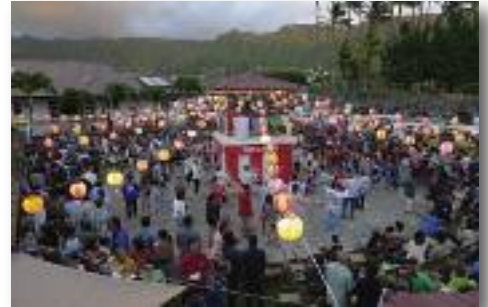
There are dozens of Obon Festivals to attend over the summer months.

Summers in Japan come to life every year with the annual Obon (or Bon) festivals during the summer, honoring the spirits of ancestors as they return to visit. Lanterns are hung in front of houses to guide these spirits home, while colorful Bon Odori (dances) are performed to traditional music. Families visit the graves of their loved ones and make offerings of food at temples and altars. After the celebration, lanterns are floated in rivers, lakes, and seas to guide the spirits back to their world.