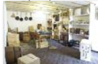
The interior is of the Depository/Dispensatory exhibit that opened in February of the cellar.

From one of the oldest theatres in the country to the oldest wooden frame structure in the islands, the HAWAIIAN MISSION HOUSES is celebrating the newly restored cellar of the 1821 Mission House as the Judd's Dispensatory and Chamberlain's Depository. The recreation of the dispensatory