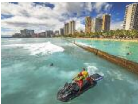
One of the City's two-person rescue jet ski teams patrolling the waters off Waikiki

O'ahu's 227 miles of coastline offer jaw-dropping views and some amazing experiences. Education is truly the best tool we have as Guards to keep people safe. Did you know we actually size people up as they arrive, assessing what they're wearing and what equipment they've brought to the beach and decide what their likelihood of getting in trouble will be? For example, a family of four hits the road at 9 or 10 a.m. and heads for Hanauma Bay. Without reservations, they're forced to keep driving, and the next beach they come to is Sandy Beach, one of the deadliest spots on our islands.