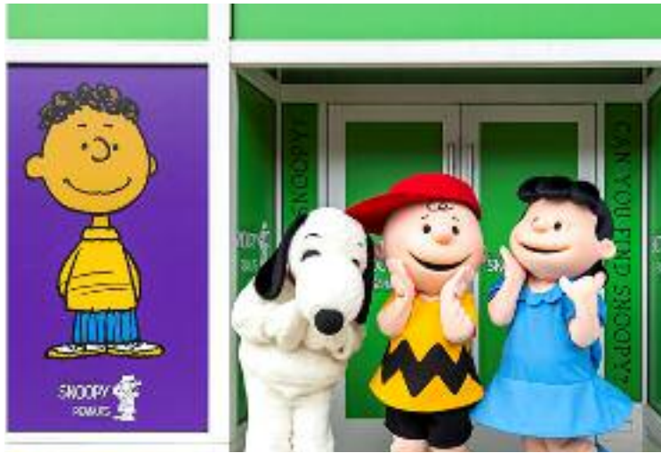
The Search for Snoopy: A Peanuts Adventure opens July 1 on the 3rd floor of Ala Moana Center and should remain open throughout the summer.

Fans of Charles Schulz's beloved comic strip are taken on a groundbreaking, one-of-a-kind adventure inside the Peanuts world, as guests uncover clues to help Charlie Brown find his beloved dog, Snoopy through life-sized sets.