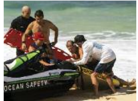
Lifeguards making a rescue at Sunset Beach