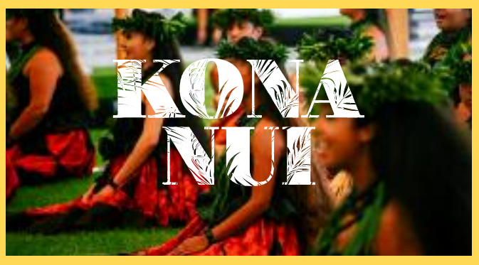
MONTHLY—Celebrates Hawaiian culture and language through performances by beloved hula halau and Hawaiian musicians.