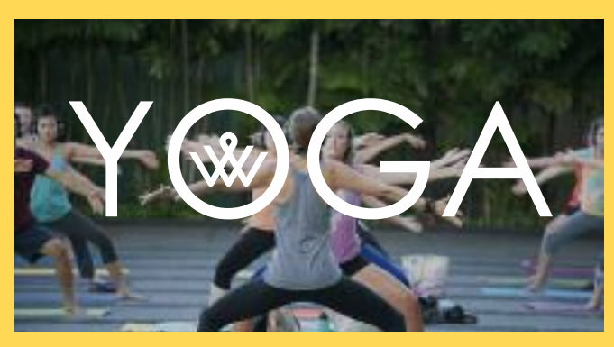
WEEKLY —Sessions welcome all ages and skill levels taught by CorePower Yoga instructors