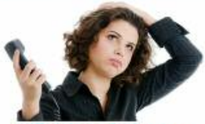
"Thank you for holding, a representative will be with you shortly."

A re you getting tired of hearing the same automatic voice answering service every day? Put down the phone because now there is a new way to book activities without picking up the phone!