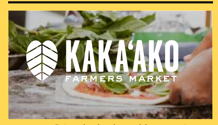
MONTHLY—Brings the abundance of the country into the heart of the city with fresh-locally grown fruits, vegetables, meats and treats.