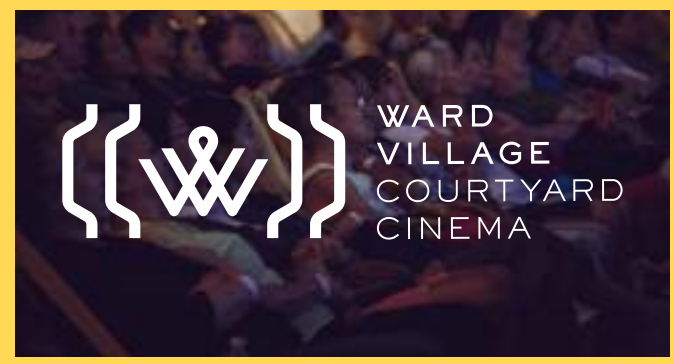
MONTHLY—Features independent films curated by the Hawaii International Film Festival and themed activities in an extraordinary outdoor theater setting.