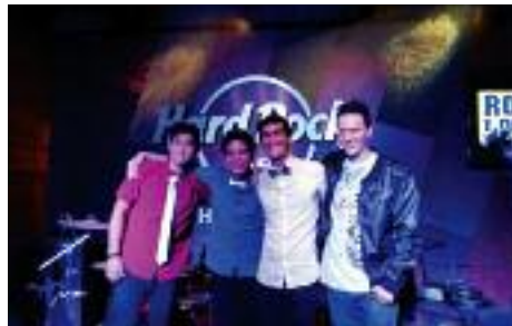
Congratulations to the Fresh Preps, winners of this years Hard Rock Rising Honolulu. They will now be judged by a panel of 12 industry experts who will pick four regional finalists, and eventually the overall winner. Good luck boys!

Do you have a picture you would like us to run? Send them to: publisher@oahuconcierge.com