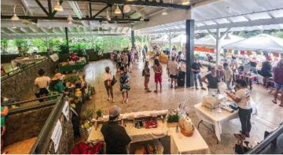
The Haleiwa Farmers Market is held in a covered pavilion at Waimea Valley.

Hawaii's farmers markets have always been a huge draw for locals and visitors alike, but you may have noticed that they exploded in popularity during 2020.