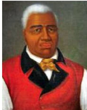
Image of King Kamehameha I

King Kamehameha I was born on the island of Hawai'i, the Big Island between 1748 and 1761. When he was born, the kahuna predicted he would become a great leader who would unite the warring clans of the islands. Such a significant prophecy frightened and angered the Ali'i at the time, who ordered the baby be put to death. To save his life, the infant was whisked away to Waipio Valley where he was raised in secrecy by foster parents until he could safely return to his parents in Kailua-Kona. It was then that young Kamehameha earned his nickname "The Lonely One." The future ruler later fulfilled the kahunas' prediction. Being present when Captain Cook came to the islands, Kamehameha learned about foreign ships and weapons, and with this new knowledge, built a strong army and united the Hawaiian Islands, bringing justice to his people and peace to the land. He went on to establish foreign trade and ushered in the modern Hawaiian flag with 8 stripes representing the main Hawaiian Islands and the Union