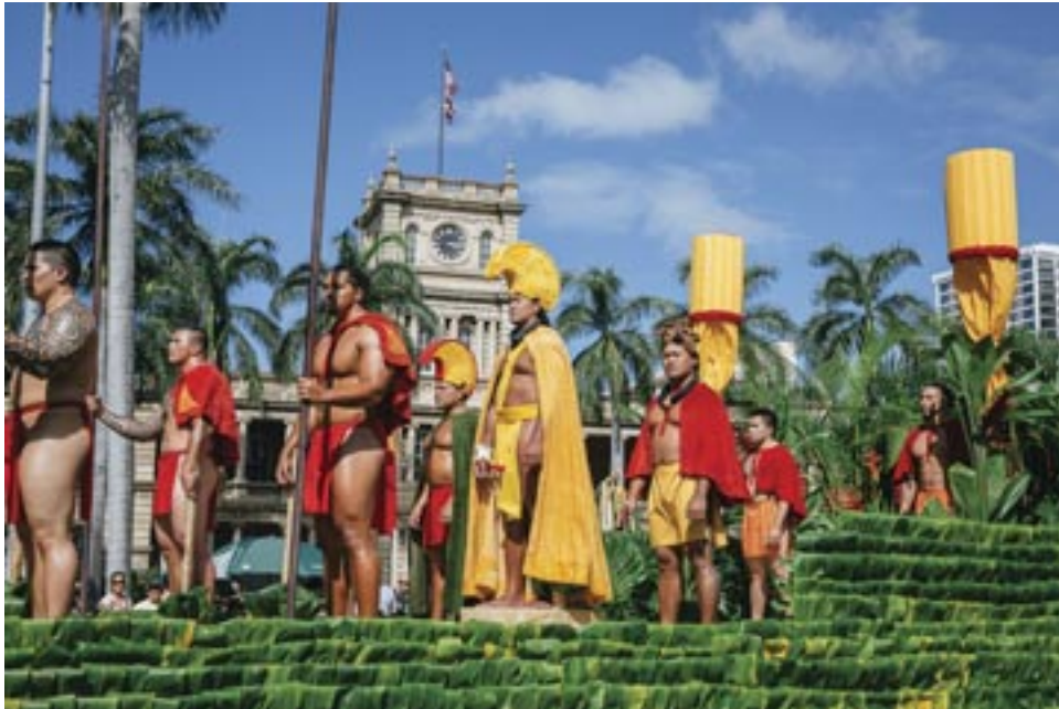
The Royal Court float in a previous Kamehameha Day Parade passing 'Iolani Palace. Don't miss this year's parade on June 10 th.

What better way to celebrate one of the most important figures in Hawaii's history than the way Hawaiian do best, with millions of flowers, music, and dance? Well, prepare for a weekend full of festivities fit for a king – King Kamehameha I, to be precise. This annual celebration brings together communities from across the region to honor and embrace the spirit of aloha while fostering a deeper understanding of Hawaiian traditions and customs, and visitors are more than welcome to watch it all unfold.