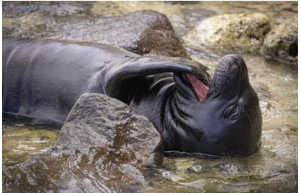
Pup PO5, now known as Pualani, taken at day 16 by acclaimed photographer Erik Kabik. Lucky for us, he often stays in the building above the seals and has taken some incredible shots.

A monk seal exhibit is on display at the Kaimana Beach Hotel