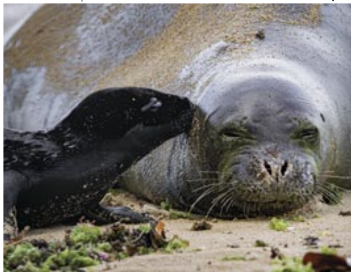
Rocky with Lōli'i in 2022 when the pup was 2 days old.