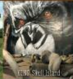
KING Skull Island