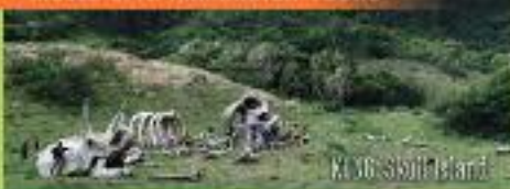
Movie Site Immersion

MOVIE SITE & PREMIERE MOVIE SITE IMMERSION TOURS