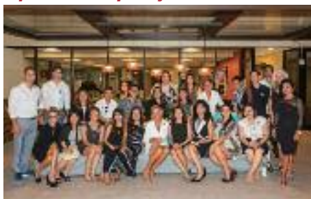
The Aqua-Aston Hospitality Sales, Marketing, and Revenue team posed with their teammates from the newly opened Holiday Inn Express at a VIP Travel Partner Mahalo Reception held at their newly renovated 4th Floor Recreation Deck at the Aston Waikiki Beach Tower last month.