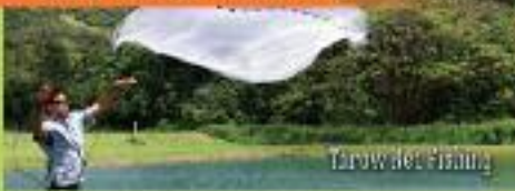
Tarrow Net Fishing

TASTE OF KUALOA "FARM TO FORK" FOOD TOUR