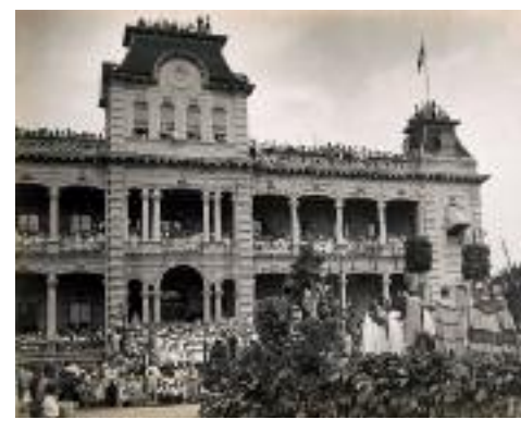
People lined every railing and even the roof of the Palace to watch the festivities

a.m. Starting on King Street, the parade will head down Punchbowl Street before turning left on Ala Moana Boulevard before eventually making their way to Kalakaua Avenue. The parade comes to a finish at Monsarrat Avenue and Kapi'olani Park.