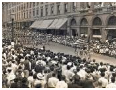
The US Military marched in the parade showing respect to the King as far back as the 30s.

A third replica was commissioned when Hawaii attained statehood and was unveiled in 1969 in the U.S. Capitol's National Statuary Hall where statues of historic figures from all 50 states are on display. Initially place in the back corner of the Hall, it was told the location was chosen because of the fact it is the heaviest statue in the Hall, weighing in at over 6 tons, and moving it safely was a