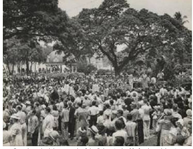
Crowds packed the grounds of the Palace in the 30s for the celebration

Unbeknownst to Hawaiian officials, the original statue was miraculously recovered after fishermen managed to recover the sunken statue from the wreck