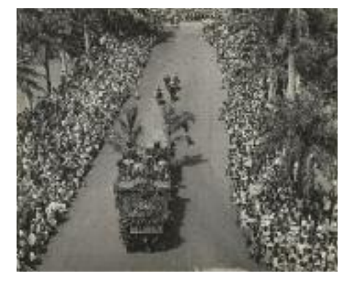
People lined the streets in Waikiki for the parade

Lāhui Hawai'i," dated June 14, 1877, reported more than 4,000 people gathered at the horse racetrack where Kapi'olani Park now sits with King Kalākaua and his consort Kapi'olani were also in attendance. The pictures of the event from the 30s shown throughout this issue show every square inch of every shot filled with people to