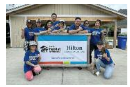
Hilton Grand Vacations had 18 employee

volunteers who joined forces with Honolulu Habitat in April to help construct a 3-bedroom, single-family home for a low-income family in Waimanalo. Habitat construction staff oversaw the volunteers and provided training and tools they needed to complete the project. Participants learned new skills while working alongside the Habitat homeowner to build their home.