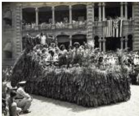
The Island of Lanai float in the 30s.