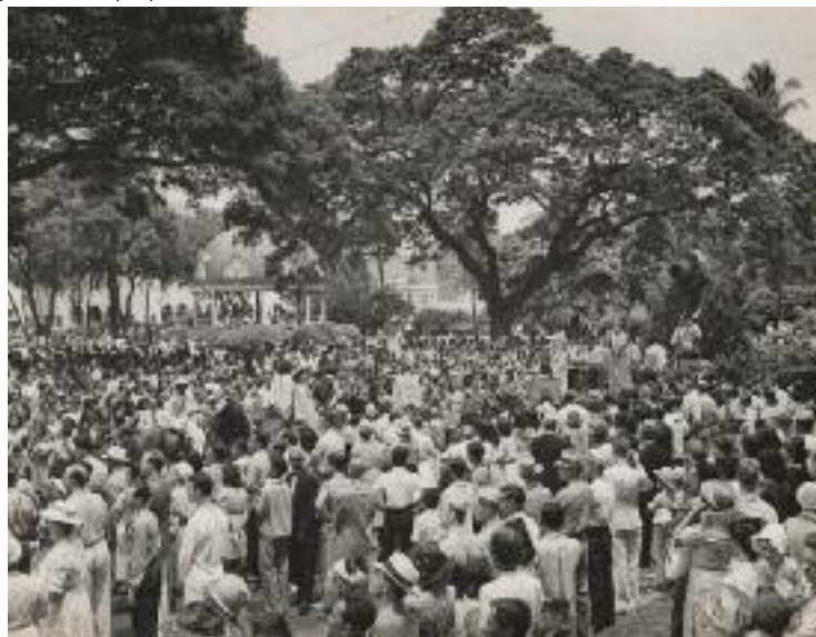
Crowds packed the grounds of the Palace in the 30s for the celebration

Unbeknownst to Hawaiian officials, the original statue was miraculously recovered after fishermen managed to recover the sunken statue from the wreck