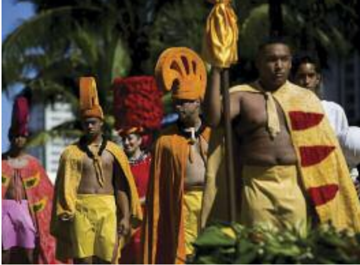
Hundreds of brightly decorated floats highlight the 105th annual floral parade honoring the father of the Hawaiian Kingdom on June 11th.

On December 22, 1871, King Kamehameha V proclaimed a national holiday to honor and celebrate his grandfather and the father of the Hawaiian Kingdom. Originally, the people of Hawai'i wanted to mark the legacy of his birthday, December 11, but he opted to honor his grandfather, Kamehameha I instead, and pushed the holiday as far away from his own birthday as possible, hence the arbitrary date of June 11. Less than six months later, the very first Kamehameha Day celebration took place on June 11, 1872. This year marks the 150th celebration of King Kamehameha in Hawaii. But, 150 years later do we all remember why? Let's look back on the life and time of King Kamehameha I.