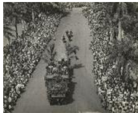
People lined the streets in Waikiki for the parade

King Kamehameha Day was one of the first holidays adopted by Hawai'i when it achieved statehood in 1959. In the early years, the celebrations featured carnivals, fairs, and lots of racing – foot races, horse races and even velocipede races. The Hawaiian Language newspaper "Ka Lāhui Hawai'i," dated June 14, 1877, reported more than 4,000 people gathered at the horse racetrack where Kapi'olani Park now sits with King Kalākaua and his consort Kapi'olani were also in attendance. The pictures of the event from the 30s shown throughout this issue show every square inch of every shot filled with people to