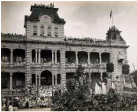
People lined every railing and even the roof of the Palace to watch the festivities

a.m. Starting on King Street, the parade will head down Punchbowl Street before turning left on Ala Moana Boulevard before eventually making their way to Kalakaua Avenue. The parade comes to a finish at Monsarrat Avenue and Kapi'olani Park.