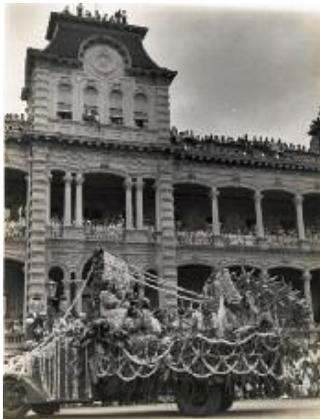
A vintage float in the 1930s in front of Iolani Palace.

who "moved in an aura of violence." He was said to have been so strong that he could lift the 2.5-ton Naha Stone, a feat that, according to prophecy, indicated the man who would unite the Hawaiian Island. His uncle gave him the training he needed, including taking Kamehameha with him when he went to meet the famed Cook, giving Kamehameha the opportunity to learn about foreign ships and weapons.