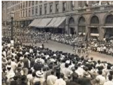
The US Military marched in the parade showing respect to the King as far back as the 30s.

A third replica was commissioned when Hawaii attained statehood and was unveiled in 1969 in the U.S. Capitol's National Statuary Hall where statues of historic figures from all 50 states are on display. Initially placed in the back corner of the Hall, it was told the location was chosen because of the fact it is the heaviest statue in the Hall, weighing in at over 6 tons, and moving it safely was a