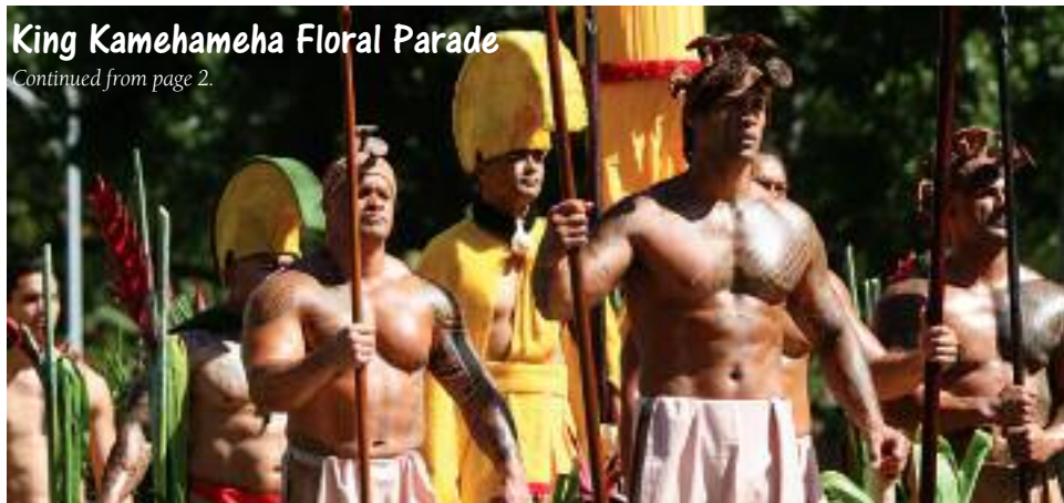
The floral parade will have plenty of brightly colored pa'u riders.

stands will be set up will be listed at the end of this article.