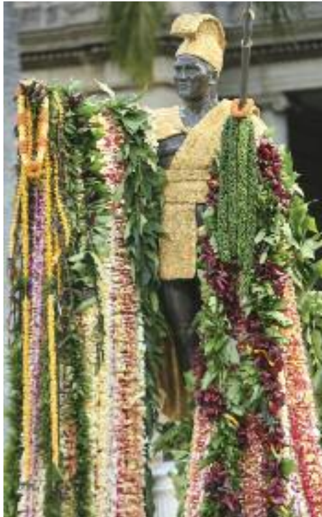
The statue in front of Alioli'ani Hale will be covered in lei on June 10th.