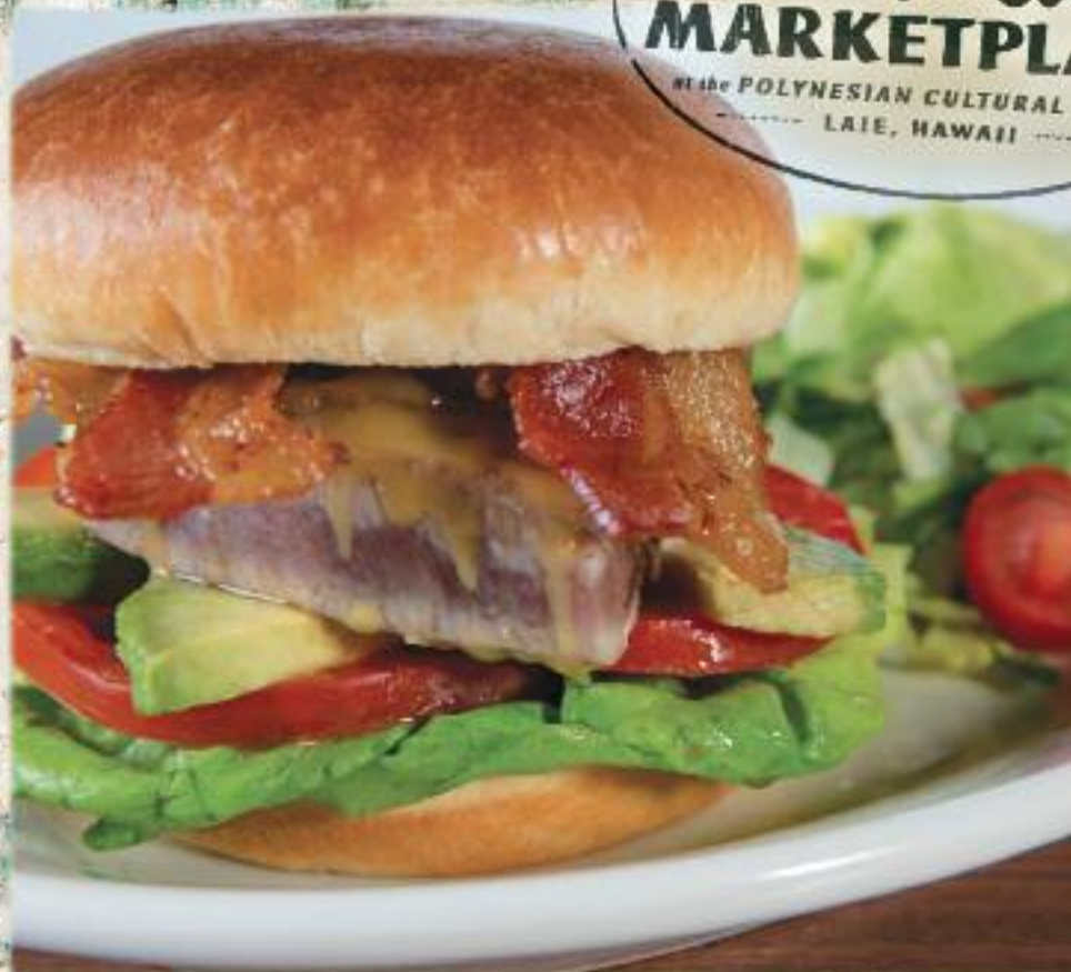
Seared Ahi & Avocado BLT

at the POLYNESIAN CULTURAL CENTER LAIE, HAWAII