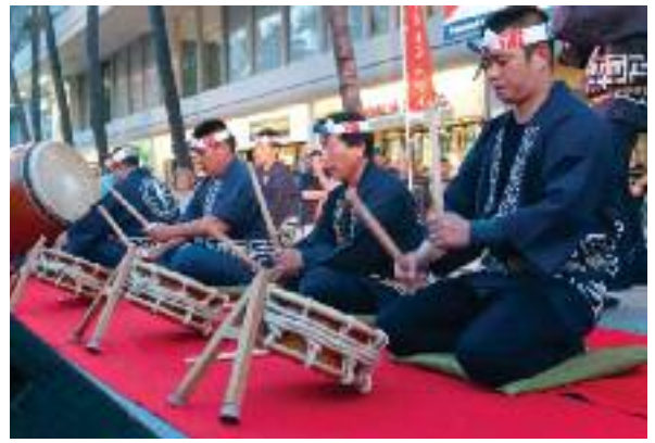
Don't miss the Ho'olaule'a Friday.

It is a rare opportunity to see these cultural presentations with traditional costumes and instruments performed all at once and outside of