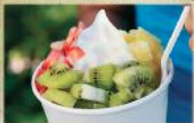
Local style Greek Yogurt