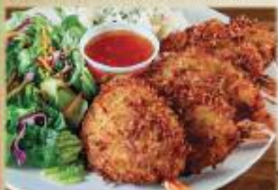
World-famous "Coco Mac Nut Shrimp"