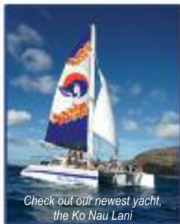
Check out our newest yacht, the Ko Nau Lani

We're a family-operated business dedicated to service, safety, quality & fun! Ocean activities for all ages and budgets. We're at your service to help provide a perfect match for your client.