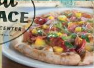
Kiawe Wood Fired Brick Oven Pizza