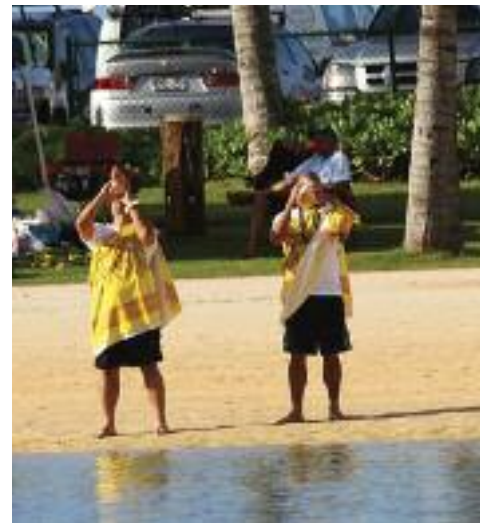
The traditional blowing of the conch shell, or Pu, is the Hawaiian way to officially mark the beginning of a ceremony. Blowing the Pu will call the festivities to order before the procession begins at Duke Lagoon.

For the past 30 years, the Waikiki Community Center's Duke Kahanamoku Beach Challenge honors our living legends that have contributed to Hawaii's water culture with a family friendly day of outrigger canoe racing, SUP races, ancient Hawaiian games and live entertainment. This year being the 30th anniversary of what many of you may remember as the Ala Wai Challenge, before it was moved to the Hilton some years ago, they will focus on the man that started it all, Hawaii's greatest waterman himself... Duke Kahanamoku.