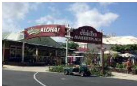
The 119,000 square foot open air marketplace out front of the Polynesian Cultural Center officially opened last month offering a bit of old-school La'ie to residents and visitors to the North Shore looking to dine, shop or just walk around.