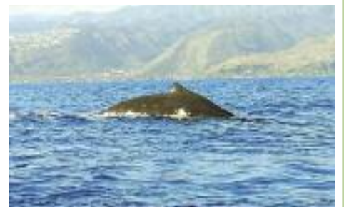
Don't miss your chance to see these amazing creatures while they are still in our waters. February was whale soup around Oahu and it's simply a sight to behold. Send your guests to your favorite whale watch, and join them while you can.