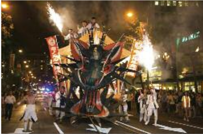
The Grand Parade never fails to delight.

The Honolulu Festival is often called "Hawaii's Premier Cultural Event." It is a festival that really does have something for everyone, from everywhere. Symposiums, sporting events, hula festivals, traditional arts festivals, entertainment all over town, a fantastic feast and, for the finale, a gala parade and a massive fireworks display over Waikiki.