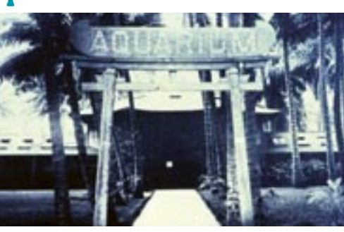
Enjoy these historical photos of the Aquarium over the years

The Aquarium opened with 35 tanks and 400 marine organisms. During its first year, the internationally renowned biologist David Starr Jordan proclaimed