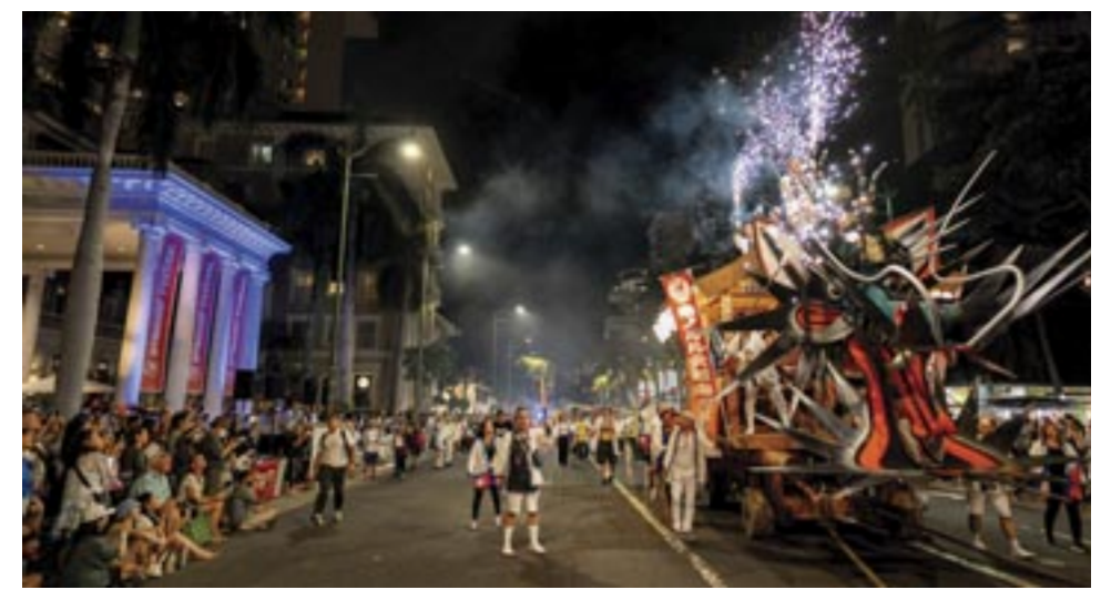
The Honolulu Festival and its important message of unity and understanding will be on display all weekend long March 8 to 10 with performances at multiple locations.

For nearly three decades, the Honolulu Festival has been a platform for fostering goodwill and friendship among the people of Hawaii and the Asia-Pacific region. It brings together locals and visitors to celebrate and appreciate the cultural diversity that makes Hawaii a unique and vibrant place. The festival also promotes the idea of a "Pacific Rim of Friendship," emphasizing the importance building connections understanding across different cultures through cultural exhibits, displays, artisans, demonstrations, and more. Get ready for an unforgettable experience that transcends borders and celebrates the beauty of cultural harmony throughout the Pacific Rim from March 8 to 10.