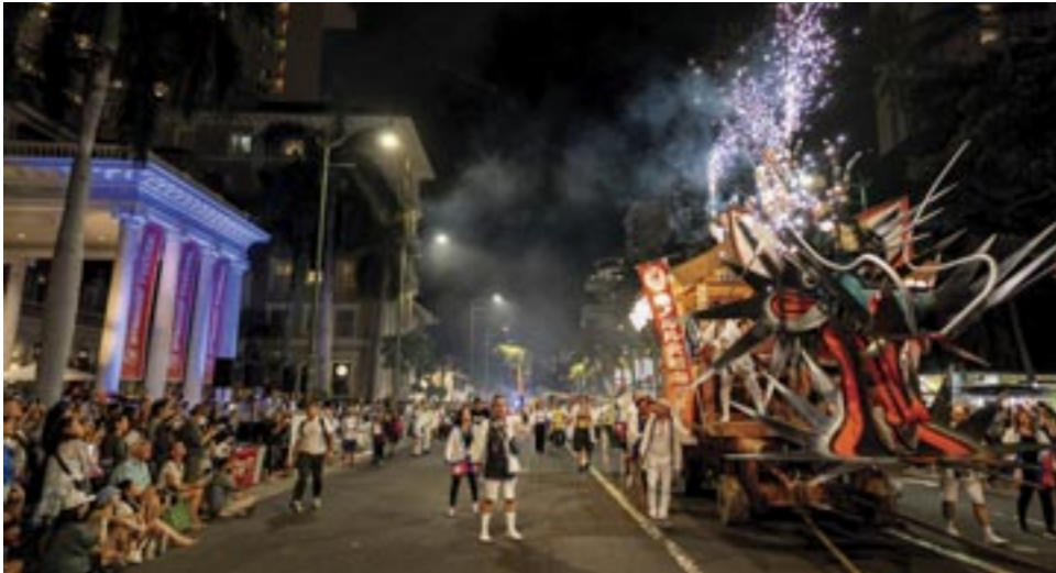
The Honolulu Festival and its important message of unity and understanding will be on display all weekend long March 8 to 10 with performances at multiple locations.

For nearly three decades, the Honolulu Festival has been a platform for fostering goodwill and friendship among the people of Hawaii and the Asia-Pacific region. It brings together locals and visitors to celebrate and appreciate the cultural diversity that makes Hawaii a unique and vibrant place. The festival also promotes the idea of a "Pacific Rim of Friendship," emphasizing the importance of building connections and understanding across different cultures through cultural exhibits, displays, artisans, demonstrations, and more. Get ready for an unforgettable experience that transcends borders and celebrates the beauty of cultural harmony throughout the Pacific Rim from March 8 to 10.