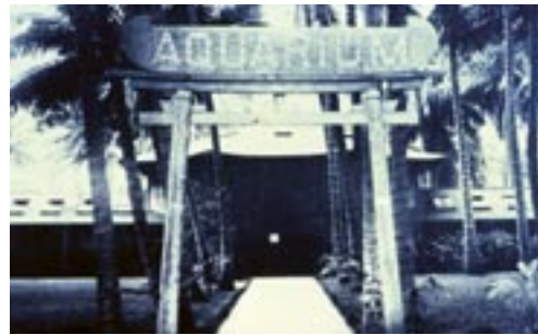
Enjoy these historical photos of the Aquarium over the years

Did you know the Waikiki Aquarium is one of the oldest public aquariums in the United States? It first opened its doors in 1904 as the Honolulu Aquarium. The Honolulu Rapid Transit and Land Company initially established it as a