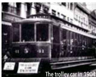
The trolley car in 1904

The Waikiki Aquarium features diverse exhibits showcasing marine life from the Pacific Ocean, with a particular focus on species native to Hawaii. It is committed to education and conservation efforts to raise awareness about marine ecosystems and the importance of protecting ocean environments. To celebrate this auspicious occasion, it has set up two days filled with educational experiences with its partners at NOAA, the Hawai'i Institute of Marine Biology, and others on March 16 and 19. For more information, go to waikikiaquarium.org .