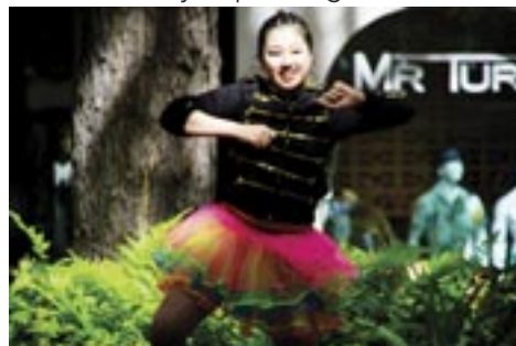
Enjoy a variety of performances in three different locations on Saturday and Sunday.

Cultural performances and exhibits will keep spectators entertained at the Hawaii Convention Center, Ala Moana Center, and Waikiki Beach Walk throughout the weekend. The stage performances will feature cultural music, art, and dance from Japan and countries around the Pacific Rim. Show times and end times vary depending on location.