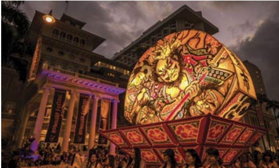
Spectacular floats are part of the Honolulu Festival's Grand Parade, making its triumphant return this month after a three year hiatus.

It was 2019 the last time the Honolulu Festival took place. The 2020 festival was canceled just three days before it was to begin due to coronavirus concerns, even though there weren't any documented cases in Hawaii at the time, and it hasn't been held since... until now. Four years later it is finally returning! The Honolulu Festival began back in 1995 and has since become one of Hawaii's most prominent cultural exchange celebrations, at one point drawing more than 100,000 people to the islands to celebrate a diverse array of cultural celebrations from Hawai'i, Japan, Korea, China, Taiwan, Australia, the Philippines, the mainland U.S., Europe, and South America. Since this is the first year the festival has returned since COVID began running rampant worldwide, and due to the fact we have yet to see our Japanese visitors return at the level they used to arrive, organizers expect this festival to be smaller than before, as there will be far fewer participants traveling here from Japan. Regardless of the potential difference in attendance, the 27th Annual Honolulu Festival is excited to bring back some of the favorite activities it's become