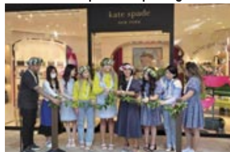
Kate Spade moved their store in the Royal Hawaiian Center to the old Furla location and held a blessing for their new location with the store staff.