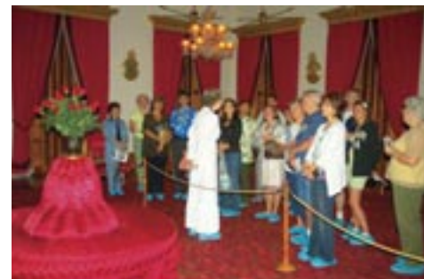
A docent-led tour in the throne room.