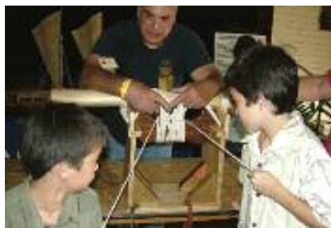
Keiki learning how to properly lash a canoe.

The canoe men and women will talk story about voyaging across the Pacific with only the stars as a guide, show videos of the Pacific voyages, and offer hands-on lessons on lashing a canoe.