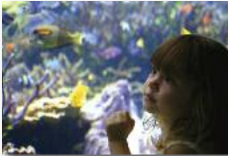
Children of all ages are fascinated by the Waikiki Aquarium.