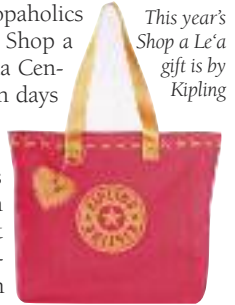
This year's Shop a Le'a gift is by Kipling

Fashionistas and shopaholics rejoice! The 7th annual Shop a Le'a returns to Ala Moana Center this month with seven days of shopping euphoria to be enjoyed by all. This spring fashion fling has become quite the event in Honolulu since it's debut back in 2008 that coincided with the completion of their last massive redevelopment project and the Nordstrom opening. Seven years later it is has become one of Honolulu's premier shopping events attracting everyone from local shopping divas to visiting fashionistas in need of some retail therapy.