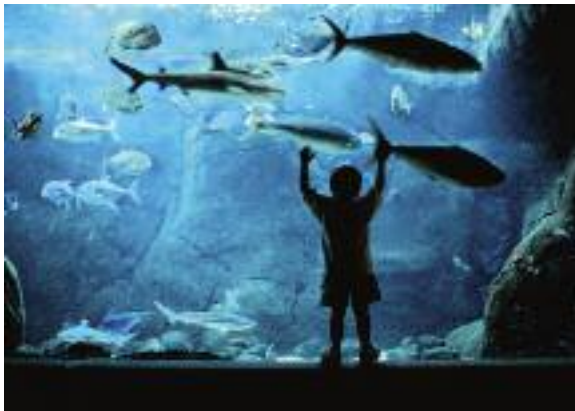
The Waikiki Aquarium has been entertaining and educating us since 1904.

On March 19 and 22 the Aquarium has an offer no one can refuse. In honor of their 110th Anniversary, they will be offering $1.10 admission all day into the Aquarium to celebrate. See, it turns out that our Aquarium happens to be the second oldest aquarium in the