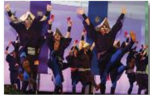
Festival participants share dance and culture throughout the weekend.

For the first time ever, runners are invited to participate in the "Honolulu Rainbow Ekiden" race welcoming runners from Hawaii, the Mainland, Japan, and around the Pacific Rim. Ekiden is a traditional Japanese marathon-style race that has been gaining in popularity since its inception over ninety years ago. On Sunday, March 3, teams of three to five runners ages 12 and up will race 5K laps from Fort DeRussy to Sans Souci Beach and back. The top three teams will be recognized at the post-race Awards Ceremony and each participant will receive a commemorative t-shirt