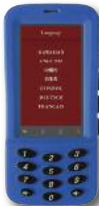
Iolani Palace's new IRIS touch screen audio tour device using state-of-the-art technology in English, French, German, Hawaiian, Japanese, Mandarin Chinese and Spanish.

There is not too much of a hands-on experience to have at IOLANI PALACE since the artifacts are out of the visitor's reach; however, there is something new at the only official residence of royalty in the U.S. that your guests can wrap their hands around! The Palace has recently enhanced its self guided audio tour with a new multi-media device, called the IRIS, created by Antenna International. The new device looks like a large cell-phone with a touch screen. The audio tour,