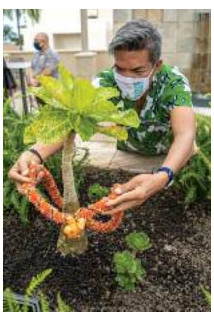
2000, fewer than 100 places a lei around the newly planted alula.

The 'Alohilani Resort is also a partner, pledging to plant 100,000 trees with HLRI to do their part in helping to revive