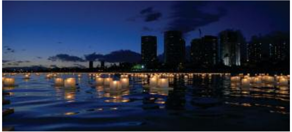
An image from a ceremony of years past.

Shinnyo Lantern Floating Hawai'i, the annual ceremony that typically draws tens of thousands of residents and visitors from around the world to Ala Moana Beach on Memorial Day for a moment of collective remembrance, harmony and expressing commitment toward building a brighter future, is going virtual this year and has announced several interactive and virtual activities in place of its usual ceremony.