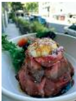
The Japanese style Beef Volcano.

Beef Volcano opened at 429 Nahua Street, just up the road from Legends Sports Bar across from the back side of the White Sands. Offering new approaches to the Japanese gyu-don concept this tiny storefront offers premium roast beef bowls using tender slices of high-quality USDA black Angus beef tenderloin slow cooked at low temps for maximum flavor. Owner Shoko Yamanaka, a yoga and fitness instructor who designed her own brand of fitness-wear that she sells at Kaplili Hawaii at the Royal Hawaiian Hotel, was looking for healthier dining options and decided to open her own place serving premium roast beef bowls. She knows what she does well, and she focuses on that. They offer four types of beef bowls with several toppings to add on if you wish. They offer