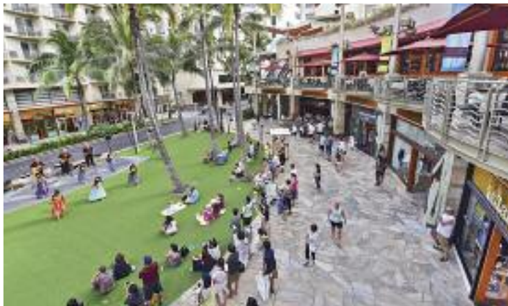
The Plaza Lawn and Stage will host the anniversary celebration.

Therefore, it is no surprise that Waikiki Beach Walk has decided to celebrate its anniversary with a special musical performance. From 4–5 p.m., guests can participate in 'ohe kapala,' the art of stamping by using inked carved wooden