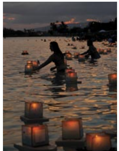
6,000 lanterns will be floated after sunset.

For those wishing to float a lantern during the ceremony, individual lanterns will be distributed on a first-come, first-