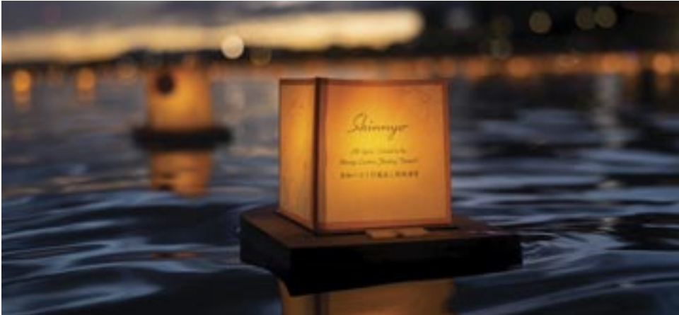
The annual Shinnyo Lantern Floating Hawai'i takes place Monday, May 27th at Ala Moana Beach Park

Since the beginning of mankind, human beings have found varying ways to cope with death, often influenced by their religious, cultural, and personal beliefs. Rituals, traditions, and ceremonies surrounding death differ widely across cultures, serving as a means of honoring the deceased, providing closure for the living, and navigating the transition between life and death.