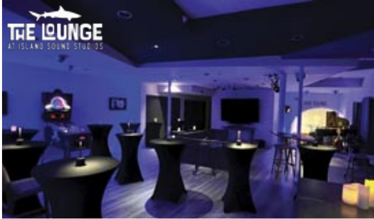
The Lounge can accommodate up to 50 with table seating for 2 to 4, table top standing room and a VIP couch. Global menu offerings by Chef Karol.

A New Venue Opens with a Curated Concert Series