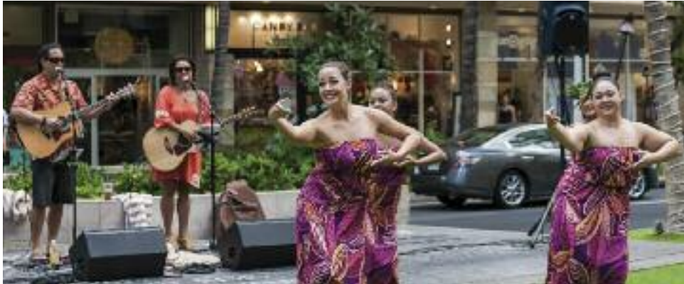
Expect Hawaiian music and dance to pop up all over town even more than usual this month as part of the Mele Mei celebration. Existing events like Waikiki Beach Walks Na Mele No Na Pua shown here, have all joined into the celebration.