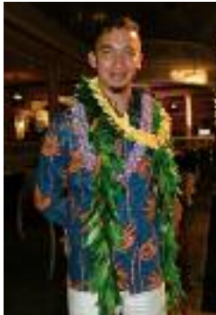
Makana will perform at the Grammy Museum Slack Key exhibit opening on May 1st

If that's not exciting enough, this should be. The Grammy Museum Slack Key Guitar exhibit is returning to the island and will be on display at Ala Moana Center in the Mauka Wing (May 1-June 30) with additional pieces on display inside