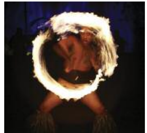
Via Tiualu, Jr. of Orlando, Florida.

Time does not make this dangerous and exhilarating art any easier. The knives are sharp and the fire is real. A quick look at Facebook shows dozens of groups dedicated to the art of Fire Knife dancing, where they constantly share stories and tips with each other, including keeping aloe as part of their tool kit they prepare for every performance. The fire is real... and hot! While many dancers have developed large callouses on their feet that helps, they are still playing with fire and sharp objects and they often get burned and cut. Aloe can be a performers best friend. This is a dangerous sport, but they start young, with kids being taught at a young age with wooden instruments before moving onto the more dangerous ones. Don't believe any parent would let their child play with fire and knives? Then don't