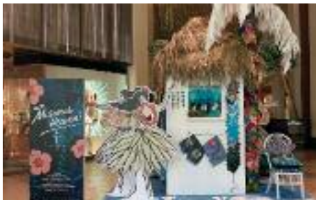
Everyone's favorite vintage mu'umu'u store has opened up a pop-up hut inside the lobby of T Galleria by DFS. Passerbys on the street will see this display. Just beyond is their purpose-built beach hut, made using 90 percent recyclable materials.

Do you have a picture you would like us to run? Send them to: publisher@oahuconciierge.com