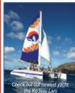
Check out our newest yacht, the Ko Nau Lani

We're a family-operated business dedicated to service, safety, quality & fun! Ocean activities for all ages and budgets. We're at your service to help provide a perfect match for your client.