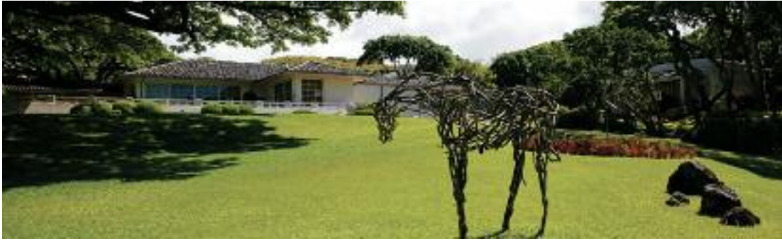
The Spalding House will close to the public sometime in mid-December and then sold. There's still time for one last visit.

Halfway up Makiki Heights Road one will find the Spalding House. A beautiful, former private residence that is now a museum, featuring multiple galleries and a sprawling sculpture-filled garden offering shady trees, manicured lawns and a million-dollar view of downtown Honolulu and Diamond Head. You walk along the gardens and truly feel as if you are wandering through your own private estate. The property is breathtaking. The view of the city from Spalding House is just as spectacular as the art inside.