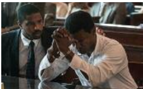
Michael B. Jordan stars as a death-row lawyer and Jamie Foxx is his client in "Just Mercy."

HIFF will also be presenting favorites from the Cannes, Venice, and Toronto International film festivals, including some of the most buzz-worthy films of the year that are likely to receive nominations in the upcoming awards season. One such film is Just Mercy , a breakout from the Toronto International Film Festival, that tells the true story of Walter McMillian, who with the help of young defense attorney Bryan Stevenson appeals his murder conviction. The powerful film was directed by Maui native Destin Cretton, and will be shown on November 13 th at 8 p.m.