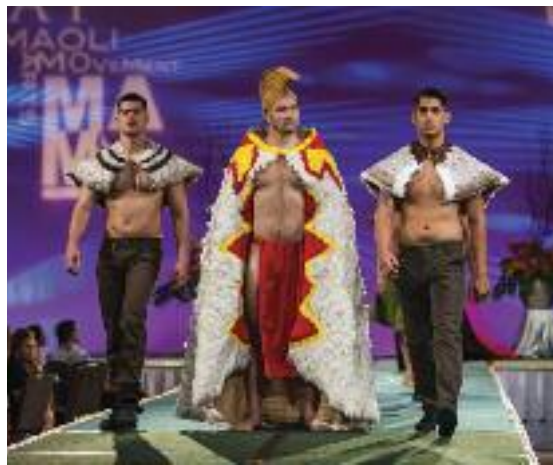
The MAMo Wearable Art Show showcases Hawaiian designers with Hawaiian flair.

This year the show will take place at the Hilton Hawaiian Village. In the past the fashion show has been held at a variety of location around the island, but Takamine says the Hilton is the perfect home for the event, offering plenty of parking and plenty of cocktail and dinner options. The MAMo Wearable Arts Show offers the elegance of a cutting edge fashion event, with leading Hawaii designers, paired with the excitement