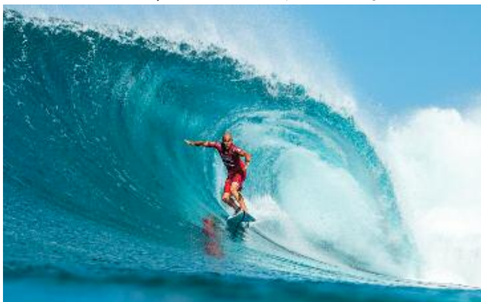
11-time World Champion Kelly Slater at the Billabong Pipe Masters last year.