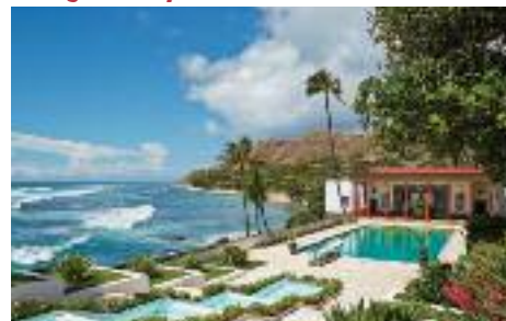
After a month-long closure for annual maintenance work, Shangri La Museum of Islamic Art, Culture & Design reopened last month. From November 6 - 17, Shangri La will host Studio Revolt, an artist-run media lab launched in Cambodia.