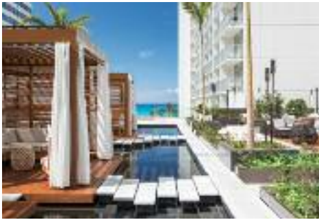
The hotel offers cabanas on the infinity pool deck

The 'Alohilani is at the site of the former Pacific Beach Hotel. After much renovation, it opened in May 2018 and quickly became one of the hip places to hang out.