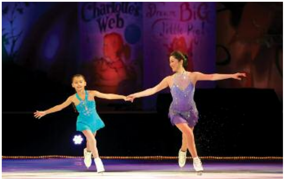
Olympic Gold Medalist Kristi Yamaguchi will be on hand to open the Ice Skating Rink on November 29 th .