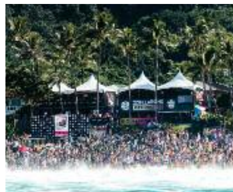
The view of the beach at Pipeline

If your guests are heading northward to watch the competitions, make sure you pass on a few words of advice to ensure their trip is fun, safe, and stress-free. It's best to take something to sit on when staking out a prime viewing spot and bring lots of sunscreen since there's not much shade from the good vantage points. There also may not be a vending machine or a food truck nearby, so remind them to pack water and some snacks to munch on when planning to watch for several hours. Turtle Bay Resort and Hale'iwa town are both great stops for lunch or dinner in either direction with a variety of restaurants