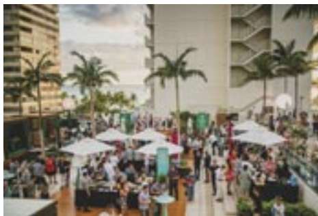
The pooldeck at the Ahihi'anii will be transformed into a bustling Asian Market as the 13th annual HFWF kicks off on November 2.