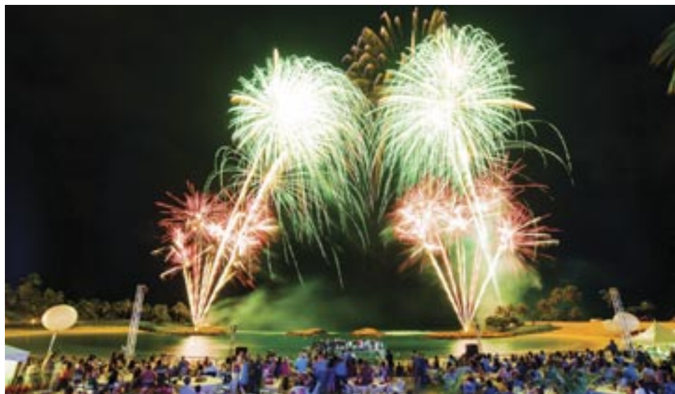
The Hawaii Food & Wine Festival returns to Oahu November 2-5. For the first time in three years, they are bringing back their beachfront event in Ko Olina complete with fireworks!

Don't miss the 13th annual Hawaii Food & Wine Festival