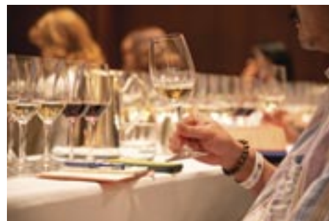
HFWF is also known for its exceptional wine seminars.