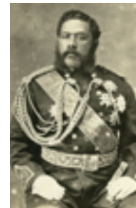
King Kalakaua.

He is best known for his role in developing Iolani Palace, which became the royal residence and the political center of the Hawaiian Kingdom. He is remembered as the "Merrie Monarch" due to his patronage of the arts and his love of music and entertainment, and the beloved Merrie Monarch Festival is dedicated to his memory. According to their website, "Kalakaua commemorated his 50th birthday with a two-week celebration of Hawaiian culture on the 'Iolani Palace grounds. Known as the "Silver Jubilee," the 1886 festivities featured ho'opa'a (chanters) and 'olapa (dancers) performing in public for the first time in years. Every year the Merrie Monarch Festival continues what the king started, by hosting a week-long festival of music, crafts, art, demonstrations and a hula competition. During festival week, the grandeur, pride, and spirit of the Silver Jubilee is alive in Hilo, Hawai'i."